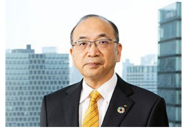
Representative Director, President & CEO

As we aim to achieve further growth as a company, in April 2022, Daiichi Jitsugyo established “ Connecting People, Connecting Technology and Enriching the World ” as its new corporate philosophy, and on April 1, 2024, revised the Daiichi Jitsugyo Code of Conduct as the DJK Group Code of Conduct in order to respond to the demands of society arising from the changing times through integrated Group efforts.